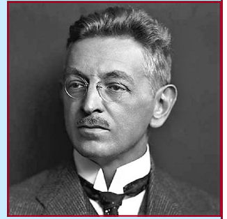
Jaroslav Kvapil (1868–1950)

Early in his life, Dvořák's compositions included short piano polkas, symphonic works influenced by the Viennese classics, and fascination with German Neo-Romanticism, exemplified by Wagner and Liszt. By the 1870s, Dvořák was forging his own unique style and including sounds of Slavic music in his works. His "mature period" and "American period" followed, including pieces that are some of his most frequently performed. Similar to other 19 th -century composers of the "national schools", Dvořák tapped folk music for inspiration.