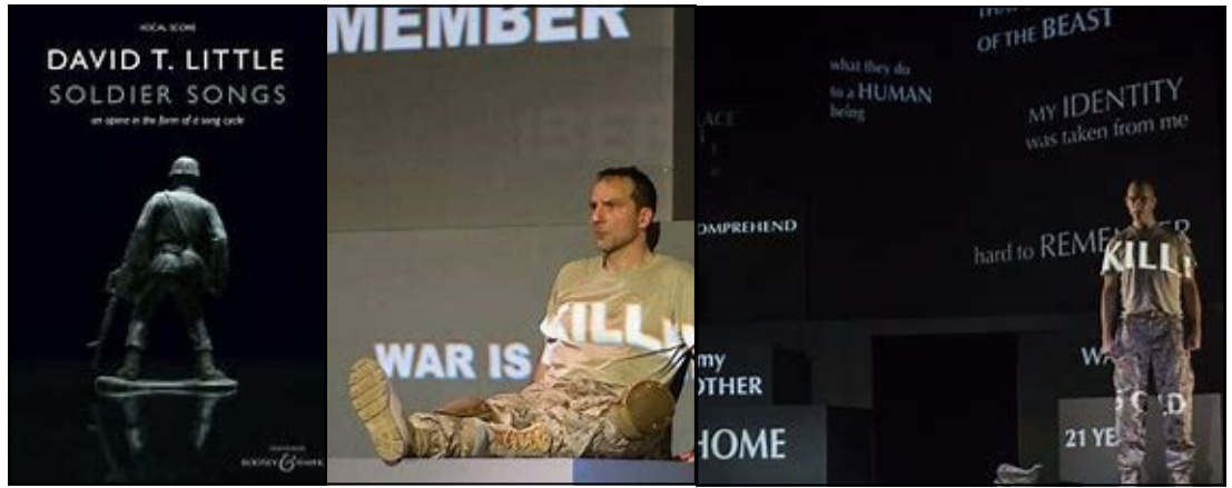
Soldier Songs production photos from The Atlanta Opera, San Diego Opera, and Beth Morrison Projects