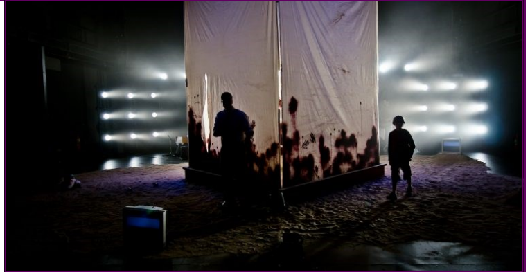
Soldier Songs