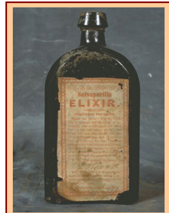
A typical elixir bottle from the sarsaparilla craze—compounds that were the “wonder and blessing of the age.”

Scene 2. Dr. Dulcamara, a fast-talking quack, arrives and sings the praises of his amazing elixir, guaranteed to cure all diseases—and even chase away mice and bugs! ( Udite, udite, o rustici ) Nemorino, who falls for the con like everybody else, asks if Dulcamara carries Isolde’s love potion. Dulcamara gives Nemorino a bottle of Bordeaux, warning him that it will only take effect after twenty-four hours (giving Dulcamara time to get away) and that it must be kept secret. Nemorino drinks enough to get tipsy, so when Adina comes by he is so full of confidence that he pretends to ignore her. ( Lallarallaa la la la la la ) Aggravated to find her swain so impervious to her charms, she promises to marry Belcore in six days. Nemorino isn’t worried because the elixir will be in effect the next day. But Belcore receives orders to leave the village in the morning, so Adina agrees to marry him immediately. Now that Nemorino is really desperate, Adina enjoys his torment. She invites everyone to the marriage feast, and Nemorino rushes away, moaning that the elixir has ruined him.