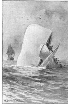
"Both jaws, like enormous shears, bit the craft completely in twain." —Page 50.