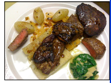
Rossini-inspired recipe: Tournedos Rossini with Foie Gras and Truffle sauce on biscotti doppo with an avocado bok choi salad and tournée potatoes.

Musicians. Rossini is deemed to be one of the most important Italian opera composers of the first half of the 19th century, and until he completed William Tell, his final opera in 1829, he was considered the greatest Italian composer of his time. Rossini retired as a very wealthy man who enjoyed giving lavish dinners attended by notable names in music.